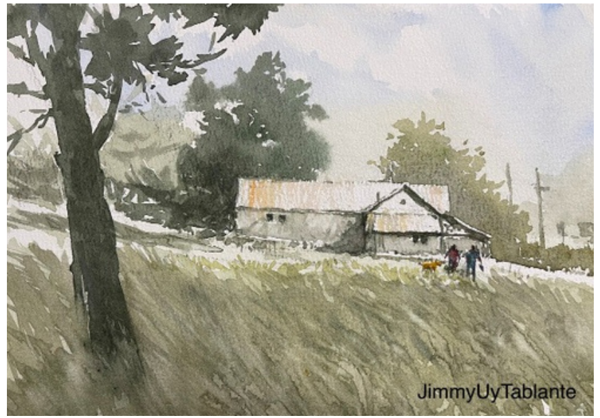
Jimmy Tablante, Best Friends