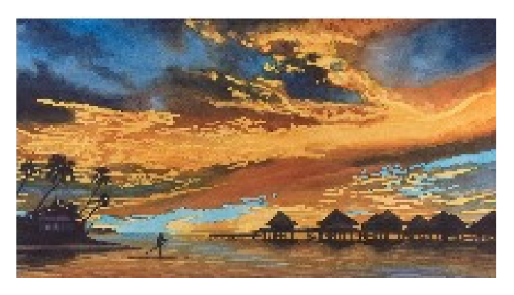
Painting Dramatic Tropical Portraits in Watercolor - Kona, Hawaii

Register now: https://www.hawaiiwatercolorsociety.org/workshops