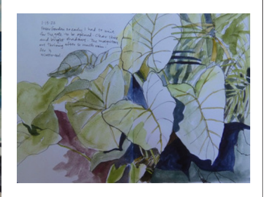
Foster Garden sketchbook