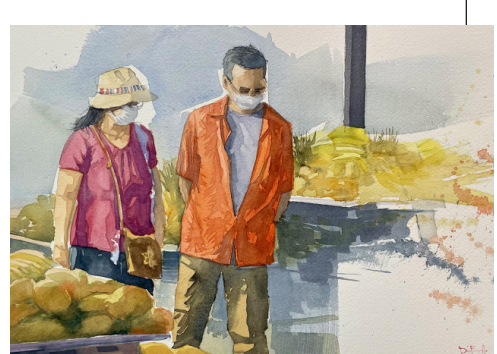
Hilo Farmers Market