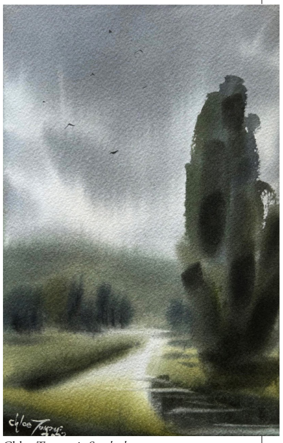
Chloe Tomomi, Soothed