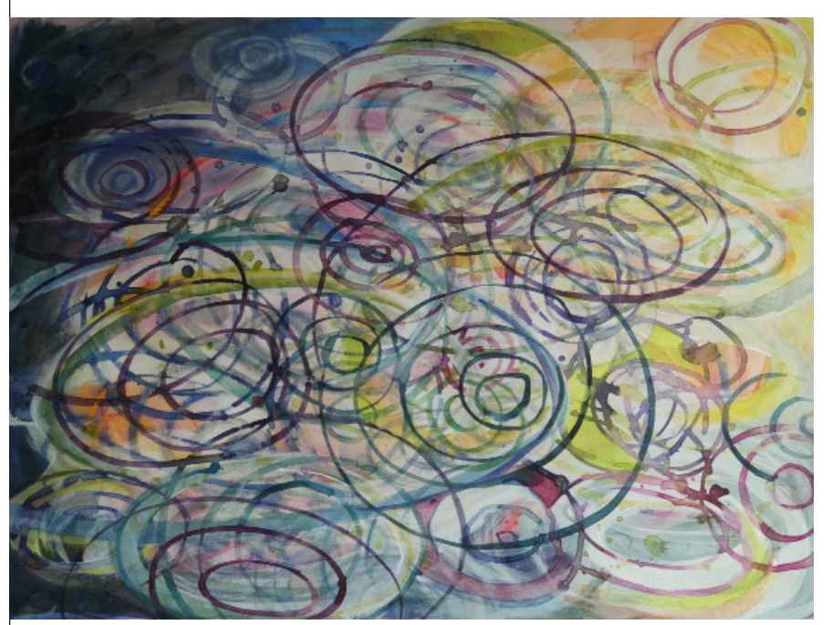
Tamara Moan, Water Song

Have ideas for gallery themes? Send in your suggestions to info@hawaiiwatercolorsociety.org.